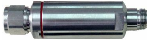
Item # 24201

Also available in PCB version for OEM customer.